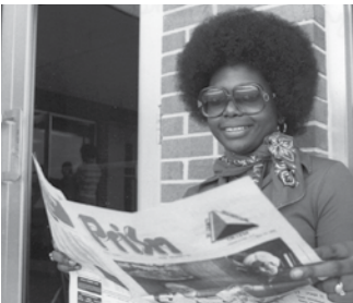
50th Anniversary Highlights.....6-7