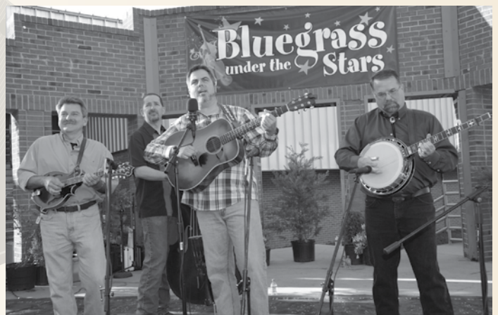
Back by popular demand, Last Road is a South Carolina-based group that plays a wide selection of traditional, contemporary, and gospel bluegrass music.