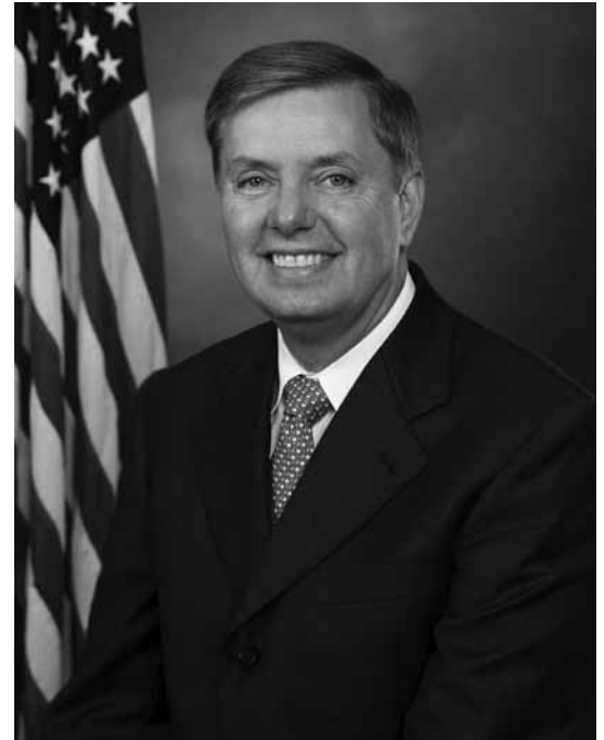
Senator Lindsey Graham

A native South Carolinian, he grew up in Central, graduated from D.W. Daniel High School, and earned his undergraduate and law degrees from the University of South Carolina. He lives in Seneca and is a member of Corinth Baptist Church.