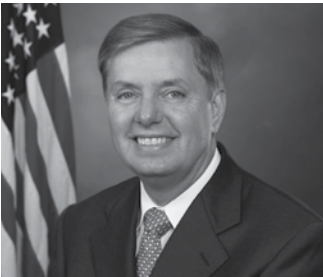
Senator Lindsey Graham To Address Graduates..... 8