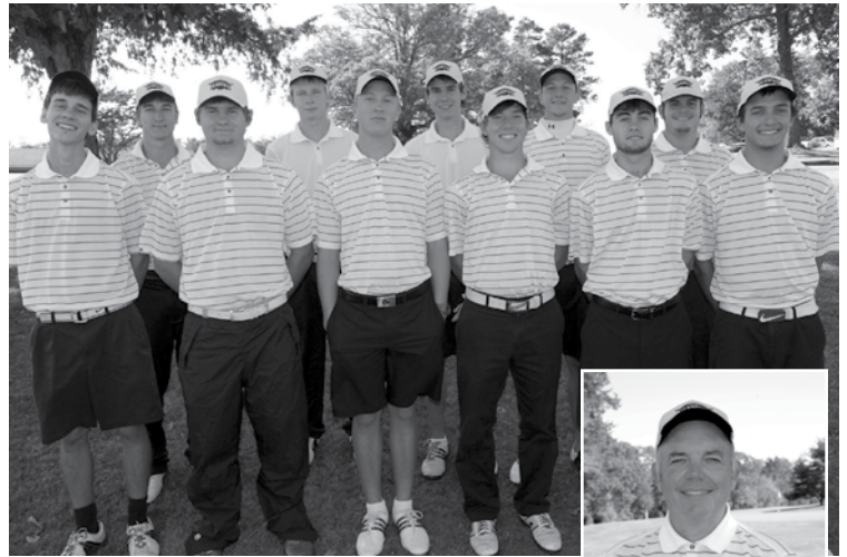
Men's Golf Team

Our athletics programs include varsity-level women's basketball, women's and men's soccer, and men's golf.