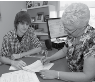
Spotlight on Orientation..... 3