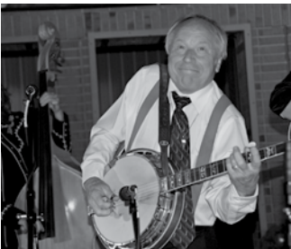
Bluegrass Under the Stars Concert..... 14-15