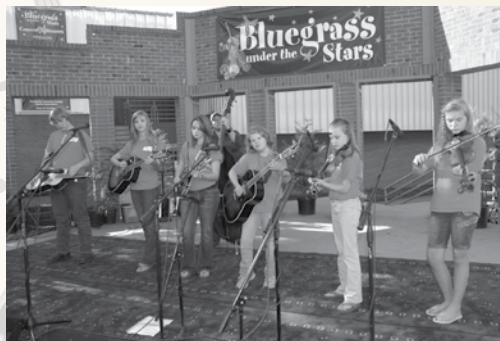
A pre-concert performance by the Young Appalachian Musicians (YAM) Sweet Potato Pie Kids kicked off the concert.